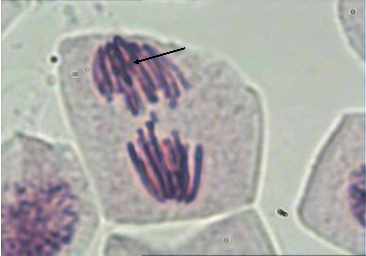
Figure 1. Acentric fragments and arch (arrow) in anaphase ( Nigella damascena L.). Figura. 1. Fragmente acentrice și arch (sageata) în anafază ( Nigella damascena L.).