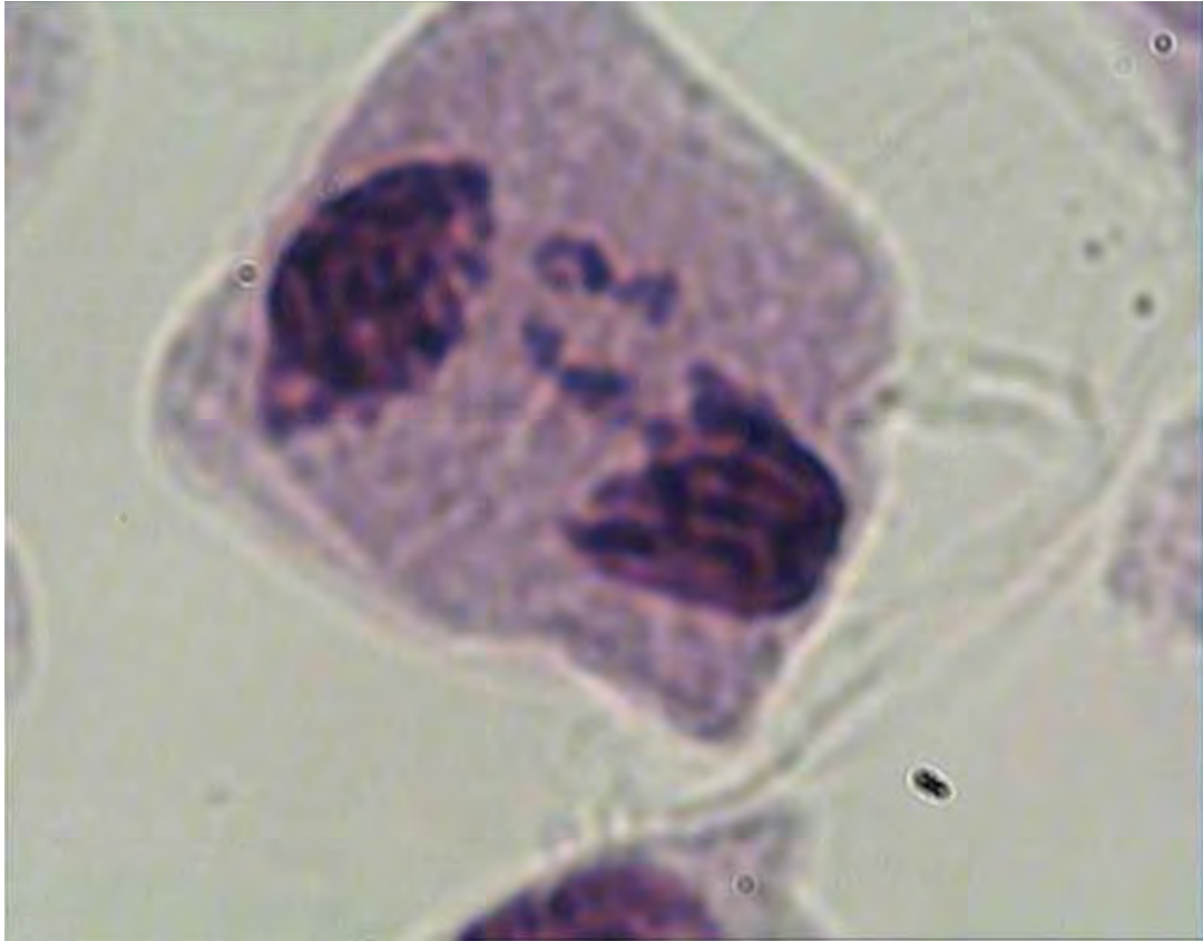
Figure 3. Broken bridge and acentric fragments in telophase ( Nigella damascena L.). Figura 3. Punte ruptă și fragmente acentrice în telofază ( Nigella damascena L.).