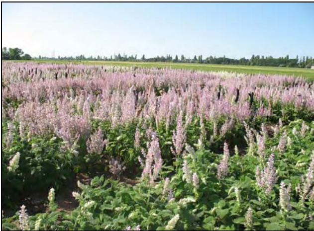
Figure 3. Biodiversity of the Salvia sclarea varieties (original). Figura 3. Biodiversitatea varietăților de Salvia sclarea (original).

Figura 2. Soiul Ambra Plus, anul al doilea de vegetație (original).