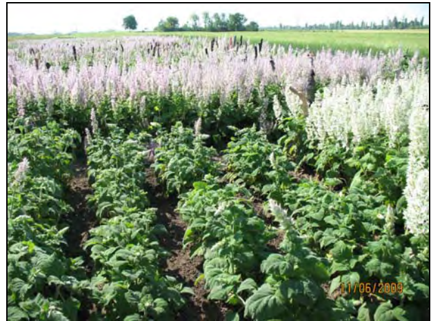
Figure 4. Salvia sclarea varieties with different period of vegetation (original).

Figura 4. Varietățile de Salvia sclarea cu diferite perioada de vegetație (original).