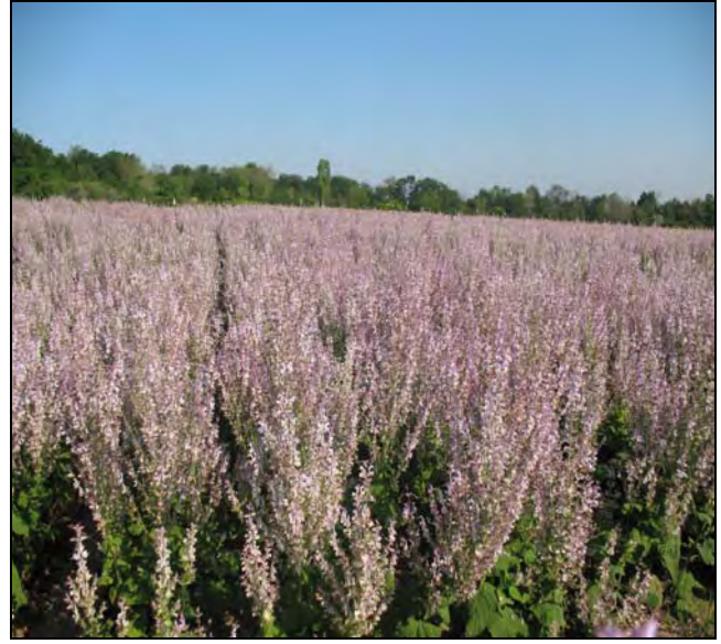
Figure 2. Variety Ambra Plus secondary year of vegetation (original).

Figura 1. Soiul timpuriu Ambra Plus, primul an de vegetație, lot izolat (original).