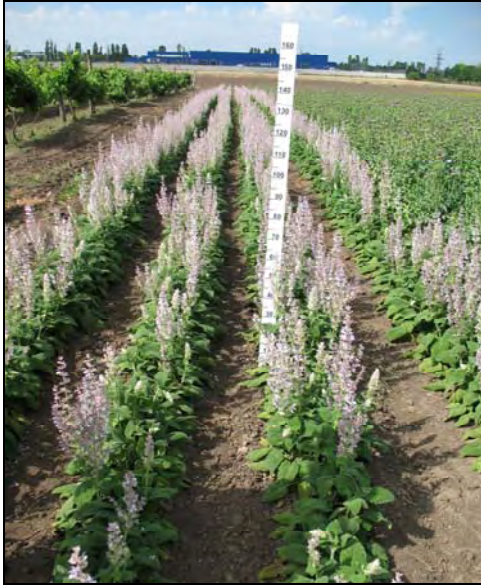
Figure 1. Early variety Ambra Plus, first year of vegetation, isolate lot (original).

Figura 1. Soiul timpuriu Ambra Plus, primul an de vegetație, lot izolat (original).