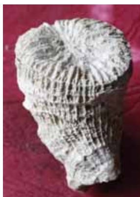
Figura 5. Situl cu brachiopode Kimmeridgian ( Lacunosella ) din Valea Fagu Oltului. Figura 6. Situl de la nord Ghilcoș cu recif cretacic. Figura 7. Calcare cu Lacunosella . Figura 8. Coral cretacic din situl F28.

Motifs for special preservation are: density of fossils, exceptional conservation of fossils, a very rich fossil assemblage and the Cretaceous reef is possible to be preserved “ in situ ” with regional geologic importance (unique in the Hășmaș Nappe).