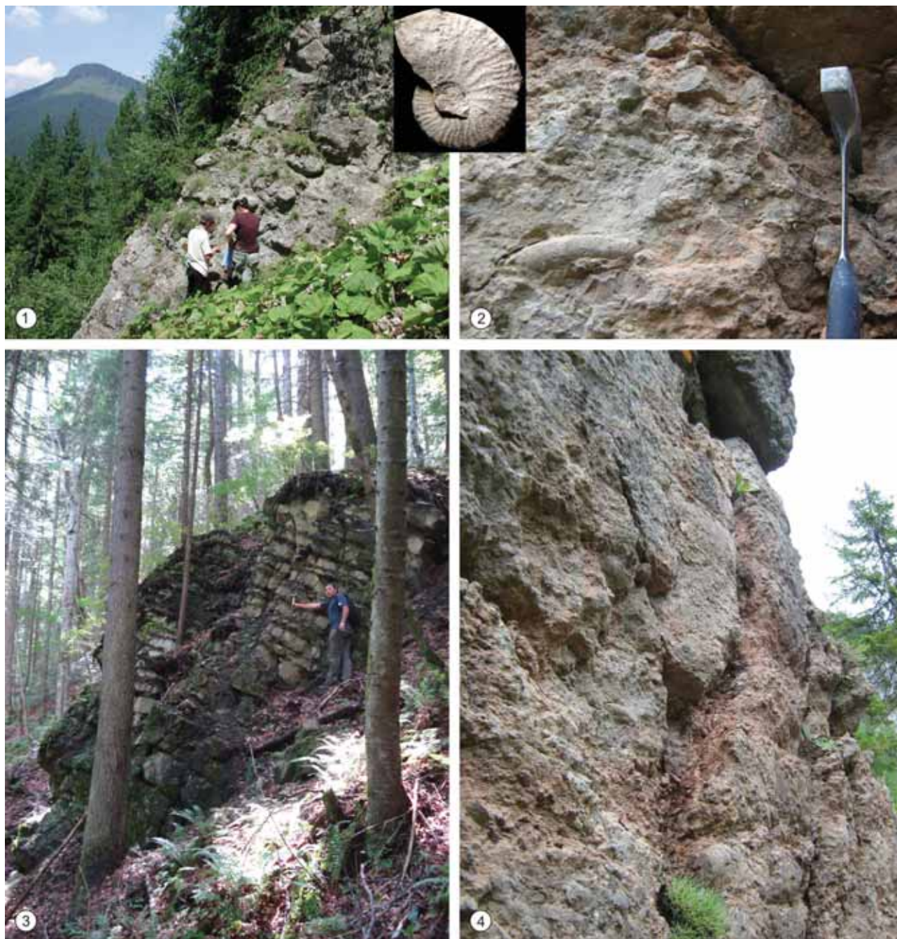
Figure 1. Western wall of Ghilcos Mountain; upper part with sandstones, marls and nodular lime, predominately grey greenish colored. Figure 2. Western wall of Ghilcos Mountain; detail of the red nodular limestone and ammonites, naturally prominent. Figure 3. One block ("D") from F2 site with well preserved stratification. Figure 4. Western wall of Ghilcos Mountain of the red nodular limestone and ammonites.

Figura 1. Peretele de vest al muntelui Ghilcos; partea superioară cu gresii, marne și calcar nodular, predominant de culoare gri cenușiu. Figura 2. Peretele vestic al muntelui Ghilcos; detaliu de calcar nodular roșu și amoniti, reliefate natural. Figura 3. Un bloc ("D") din situl F2 cu stratificare bine conservată. Figura 4. Peretele vestic al muntelui Ghilcos de calcar nodular roșu și amoniti.