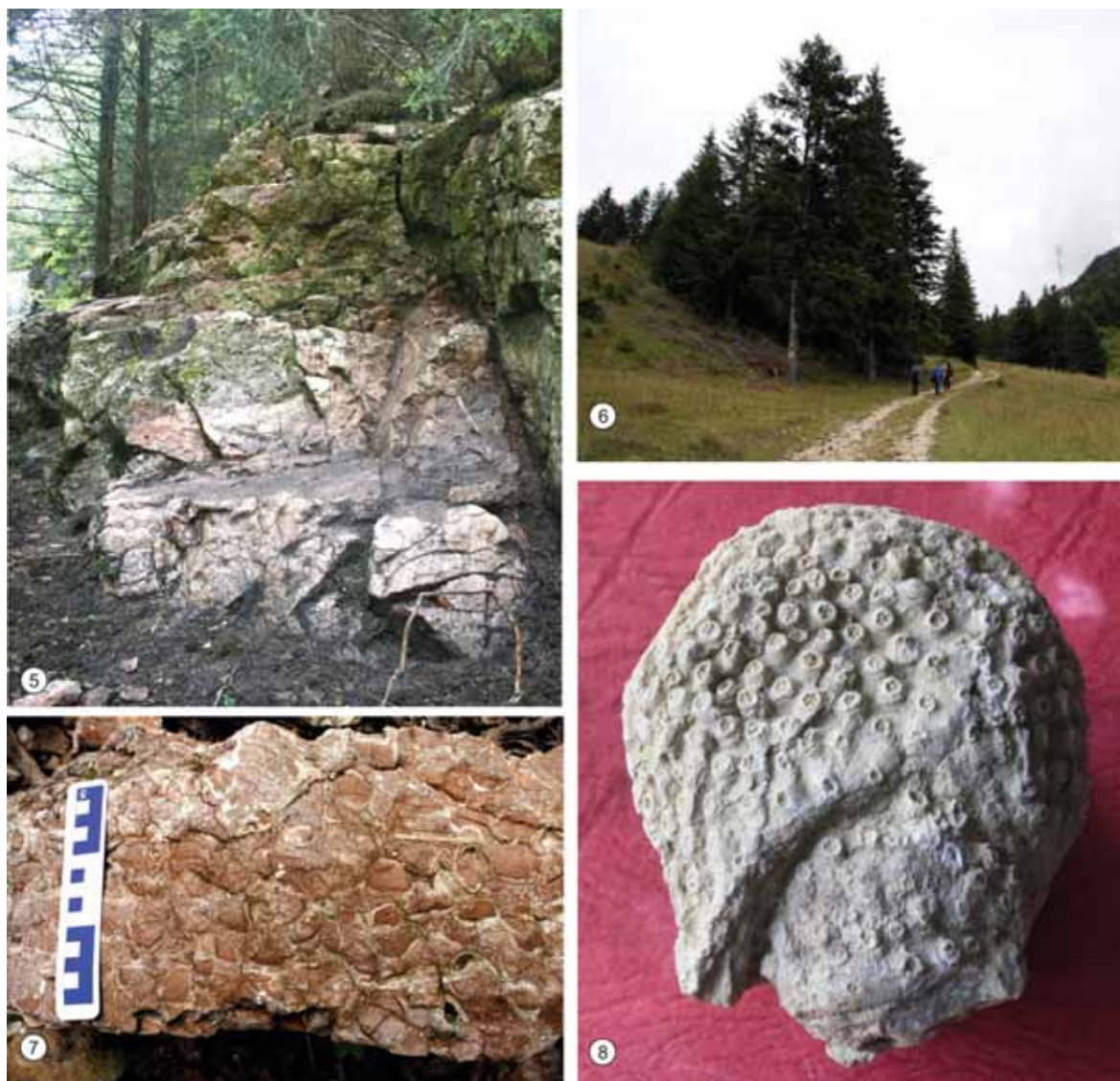
Figure 5. Site with Kimmeridgian brachiopods ( Lacunosella ) in the „Fagu Oltului” Valley. Figure 6. Site from northern Ghilcoș with Cretaceous reef. Figure 7. Limestones with Lacunosella . Figure 8. Cretaceous coral from site F28. (Photos 5, 7 – Lazăr Iuliana; 6 – Paraschiv Valentin; 8 – Cioacă Vladimir).

Figura 5. Situl cu brachiopode Kimmeridgian ( Lacunosella ) din Valea Fagu Oltului. Figura 6. Situl de la nord Ghilcoș cu recif cretacic. Figura 7. Calcare cu Lacunosella . Figura 8. Coral cretacic din situl F28.