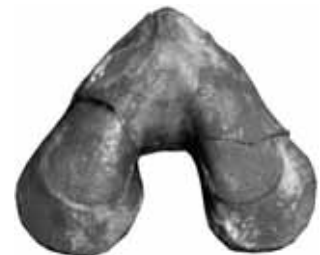
Figure A. Pygope janitor (PICTET 1867) (x 1).

The fossils assemblage is dominated by ammonites (175 species) documenting the Kimmeridgian–Early Tithonian age of these deposits, where the Kimmeridgian is well developed. There were described species (by Neumayr, Herbich, Preda and Grigore) from many genera like: Phylloceras , Sowerbyceras , Lytoceras , Taramelliceras , Glochiceras , Streblites , Hemihaploceras , Idoceras , Nebroditites (Fig. B), Presimoceras , Lessinicerias , Trenerites , Progeronia , Schneidia , Lithacoceras , Torquatisphinctes , Crussoliceras , Virgalithacoceras (Fig. C), Subplanites , Orthosphinctes , Parataxioceras , Aspidoceras , Physodoceras , Epaspidoceras , Pseudowagenia , Schaireria , Orthaspidoceras , Hybonoticerias , Sutneria , Aulacostephanus , Gravesia and others (the complete list and detailed palaeontology in GRIGORE, 2002). Special mention are: the largest representation of Sutneria in the world, many important holotypes for Kimmeridgian had been found here, the mixture of Mediterranean and Submediterranean faunas offering the possibility of correlations, presence of plants besides ammonites as special