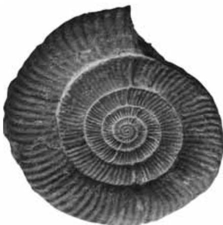
Figure B. Nebroditites doublieri (D'ORBIGNY 1850). (x 0.75) (Photo: Grigore Vlad).