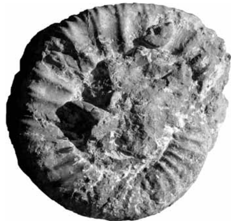
Figure C. Virgalithacoceras tantalus (HERBICH 1878) (x 0.40).

Special references: HERBICH (1866, 1878), NEUMAYR (1873), JEKELIUS (1921), PATRULIUS (1960), PATRULIUS et al. (1969), PEDA (1973), GRIGORE (1996, 2000a, 2000b, 2002, 2009, in press), GRIGORE & MARCU IULIANA (2009), GRIGORE et al. (2009), TURCULEȚ & GRIGORE (2006).