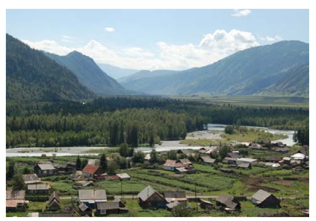
Figure 3. The Bukhtarma Valley, Southern Altai, East Kazahstan. / Figura 3. Valea Bukhtarma, sudul Altaiului, Kazakhstanul de est.