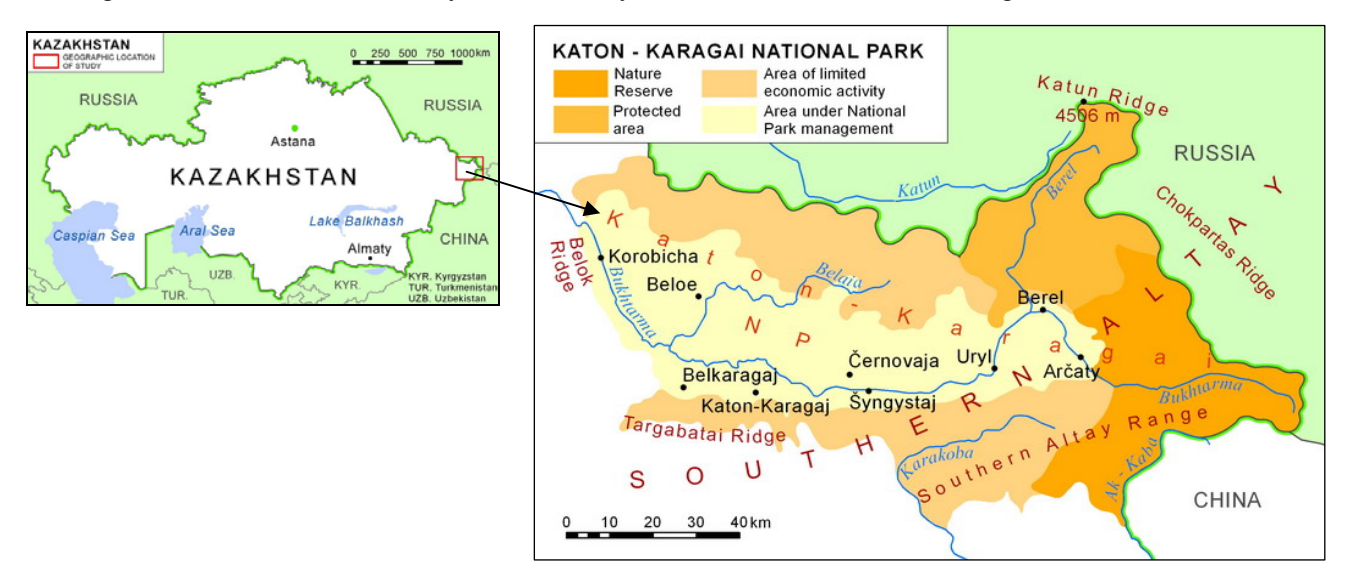
Figure 1. Geographical location of the study areas, Katon-Karagay National Park. / Figura 1. Poziția geografică a zonelor studiate, Parcul Național Katon-Karagay.

was an integral part of biodiversity mapping on the territory of the Altai particularly in relation to geo-botanical studies The applied Quaternary ecology approach is based on the identification of the diagnostic abiotic and biotic factors defining the status of a local biodiversity health, stability and/or rate of environmental change.