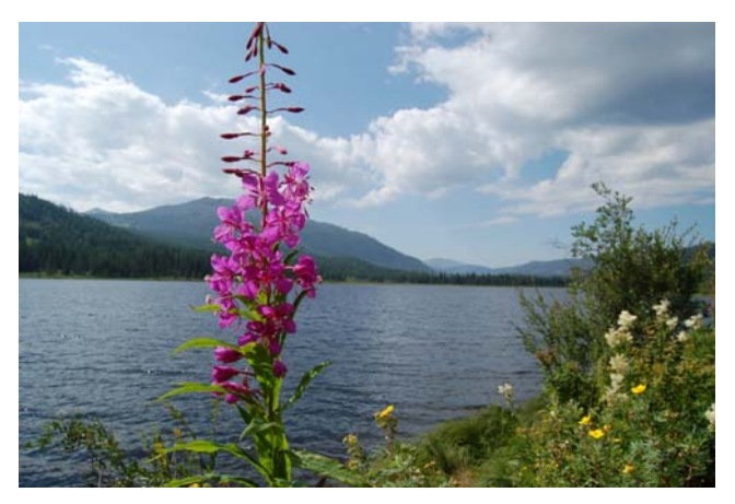
Figure 2. The Jazovoye Ozero Lake setting, representing a unique pristine Altai ecosystems, Katon-Karagay National Park, East Kazakhstan. / Figura 2. Aşezarea Lacului Jazovoye Ozero, reprezentând un ecosistem unic și nepoluat din Altai, Parcul Național Katon-Karagay, Kazahstanul de Est.

microbacterial solutions in phenol, naphthalene, toluene, xylene, ethylbenzene and benzene agars (KOUTNY et al., 2003). The study samples originated from differentially developed soils, ranging from an organic-rich, humid brown forest soil and a dark brown forest-steppe chernozem to a poorly developed regosolic high-mountain rocky semi-desert soil. The concentration of the detected bacteria strains in the complete KING-FU agar greatly varied, with the highest proportion of bacteria (up to 10^6 CFU/g) in the samples from more humid mixed southern taiga forest locations with mixed arboreal communities of larch ( Larix sibirica ), pine ( Pinus sibirica ) and birch ( Betula sp.). The recorded phenol-degrading strains prove the presence of phenol in the pristine Altai environments a priori unexposed to modern industrial pollution. No other bacterial strains characteristic of industrial contamination were found. The final results support the assumption that some key enzymes used for the biodegradation of modern xenobiotics did apparently not develop in the reaction to the modern industrialization and the related anthropogenic pollution, but may occur in their natural forms promoting degradation of various chemical compounds derived from decomposing organic matter (plant tissue, etc.) (CHLACHULA et al., 2002).