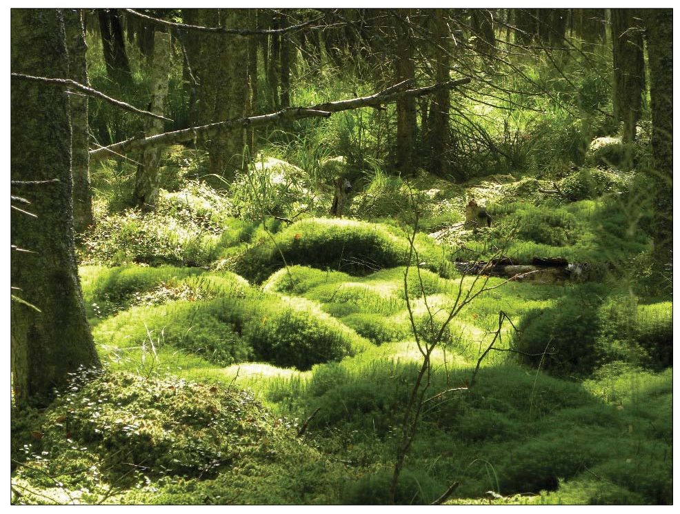
Figure 3. The peat bogs occupy the shore areas of the Lebsko Lake, the Slowinski National Park. Figura 3. Turbăriile ocupă arealele de pe țărmurile lacului Lebsko, Parcul Național Slowinski (original).