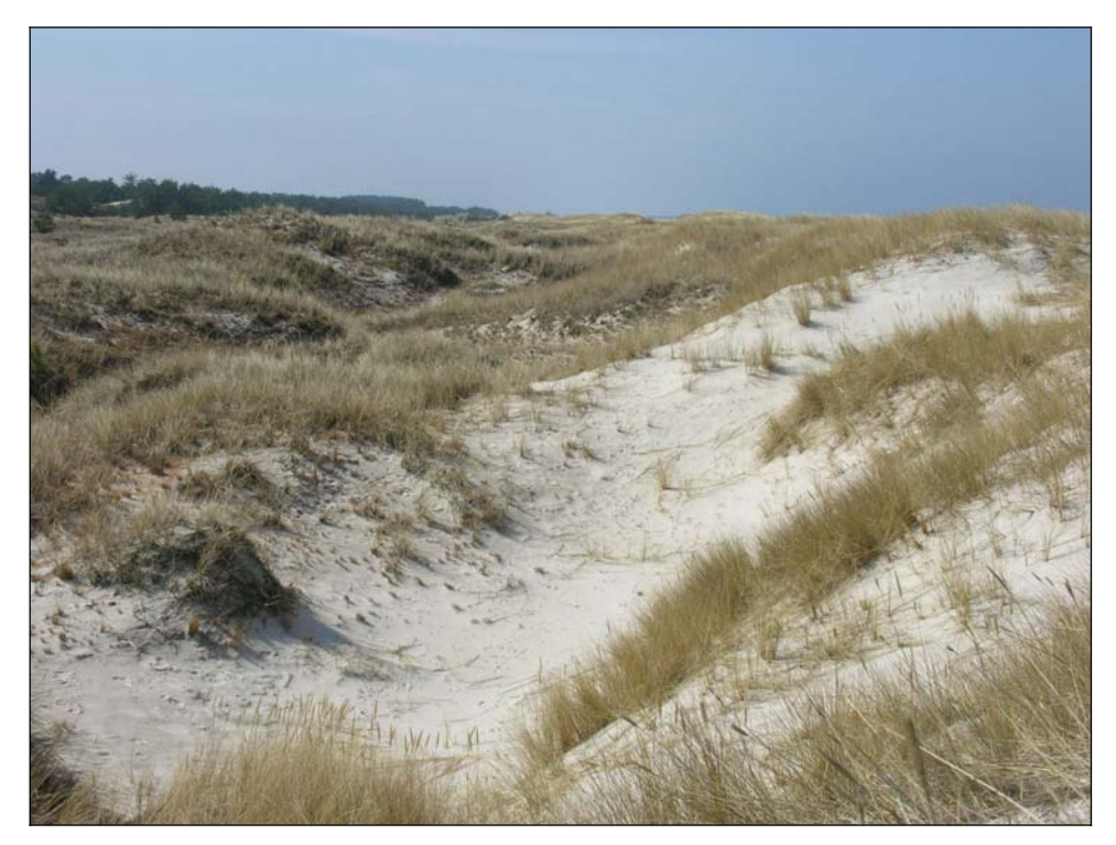
Figure 2. The belt of coastal sand dunes in the Slowinski National Park (with Carex arenaria ). A piezometer location. Figura 2. Dune de nisip în zona de coastă a Parcului Național Slowinski (cu Carex arenaria ). Localizarea piezometrelor (original).