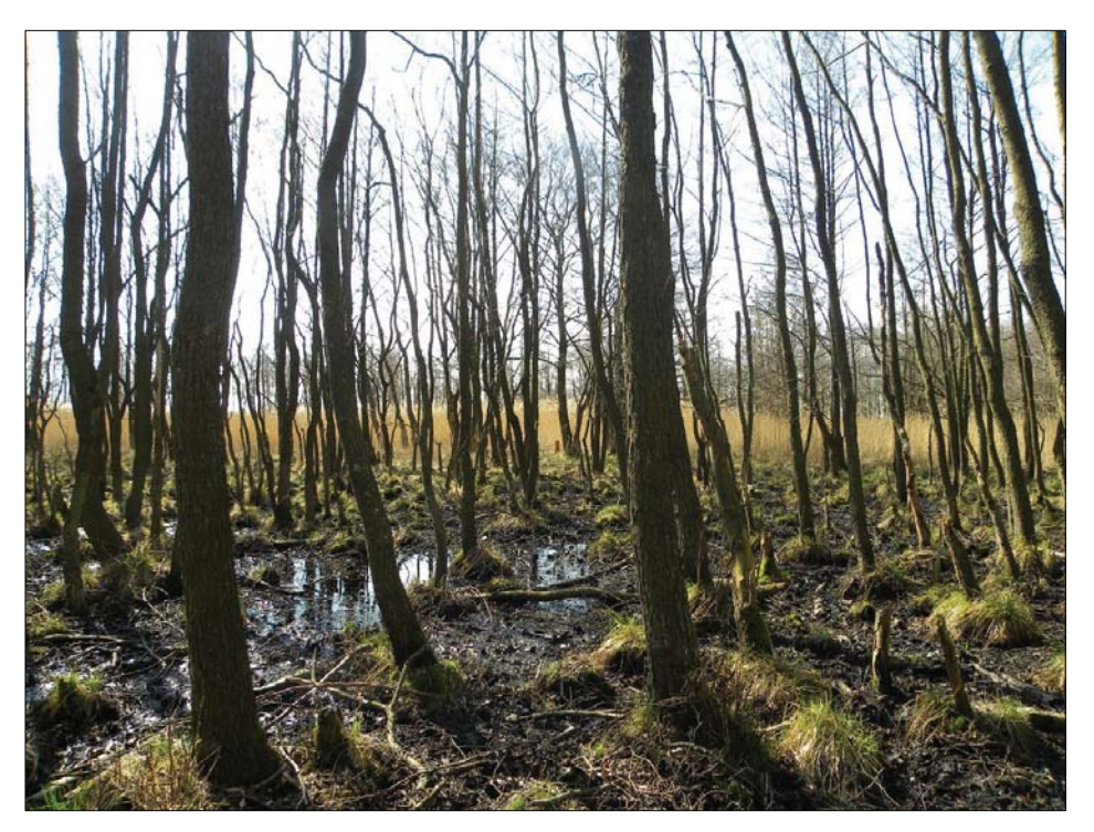
Figure 4. The alder carr ( Carici elongatae-Alnetum ) which develops along the shore of Lebsko Lake, The Slowinski, National Park. Figura 4. Carici elongatae-Alnetum care se dezvoltă de-a lungul țărmurilor Lacului Lebsko, Parcul Național Slowinski (original).