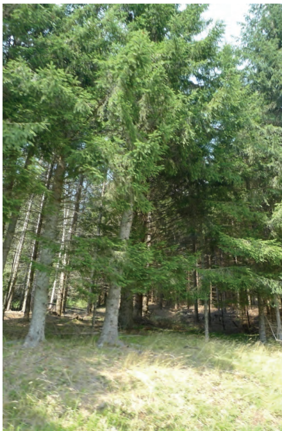
Figure 3. Spruce forest in Valea Vâlsanului reserve (original).

Floristic composition: edifying species: Picea abies și Abies alba . Characteristic species: Hieracium rotundatum . Other important species: Senecio nemorensis , Campanula abietina , Calamagrostis villosa , Luzula luzuloides , Luzula sylvatica , Oxalis acetosella , Stellaria nemorum , Lycopodium annotinum , Gentiana asclepiadea , Huperzia sellago , Dryopteris filix-mas , Fragaria vesca , Polygonatum verticillatum .