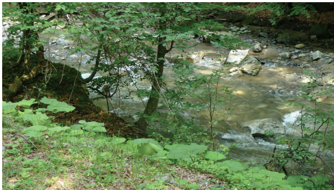
Figure 4. Alluvial forest with Alnus incana and Telekia speciosa along the Vâlsan River (original).

The potential threats in the future could be: illegal tree cutting, touristic actions (camping & the consequent waste, bush cutting, car washing in the river), sheep or cows grazing inside the forest.