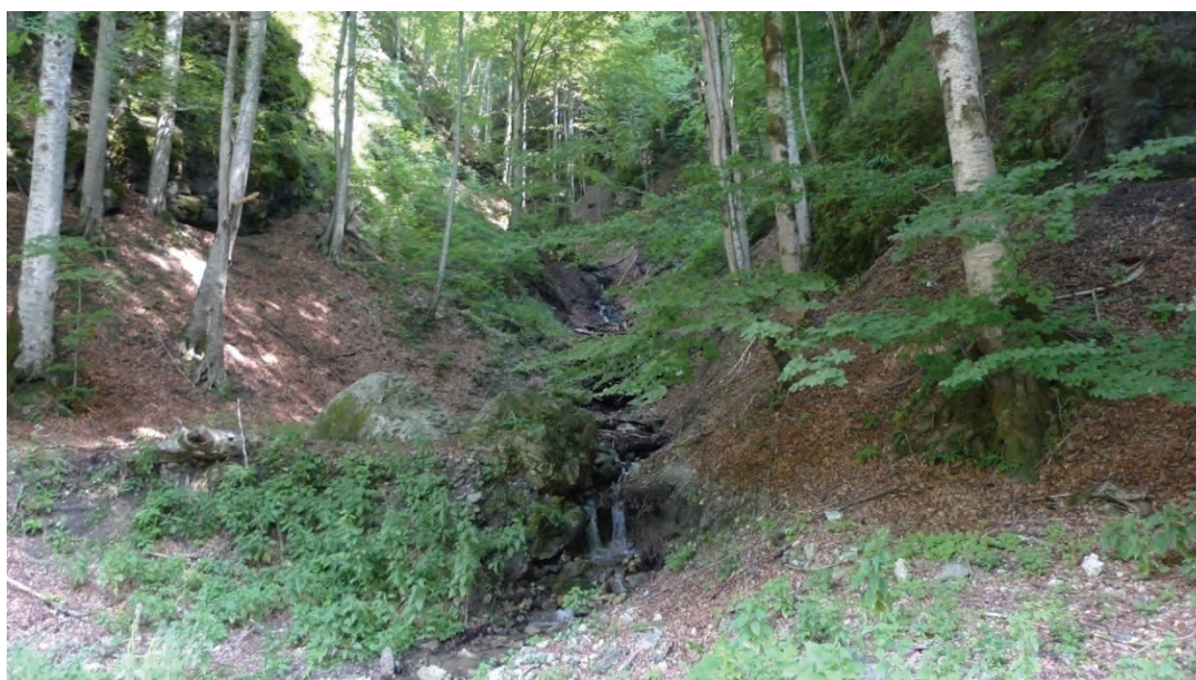
Figure 2. Beech forest in Valea Vâlsanului Reserve (original).

Potential threats are related to property regime, the lack of understanding of the legislation of nature protection, misapplication by the state of the compensation for the limitation or suppression of protective measures in the protected areas. Cutting, extraction of alive or dead wood from private forest is a dangerous issue for the present and also for the future. Arboretum composition from the high altitudes will change, even if exploitation will be made according to ecological shares. It will be necessary to introduce softwood seedlings.