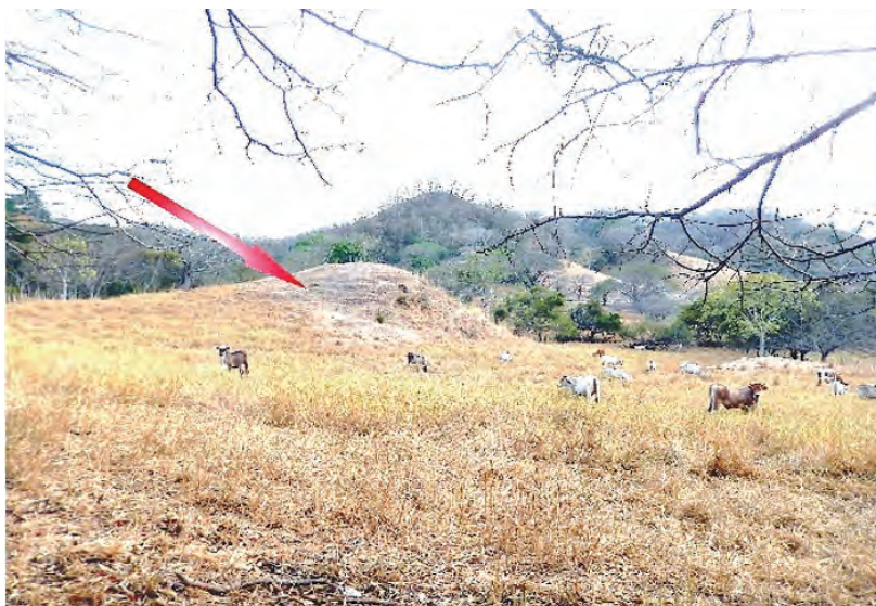
Figure 12. Deforested land, transformed into pastures; it does not retain rain water anymore and starts degrading, Costa Rica. The deforested terrain is exposed to winds and dryness.