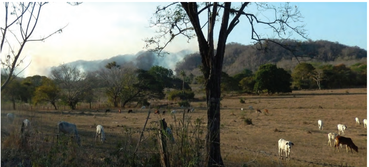
Figure 20. Dry tropical forest, pastures and wildfires induced by drought.