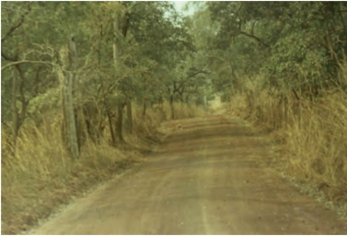
Figure 9. Gallery forest, Senegal (Niokolo-Koba).