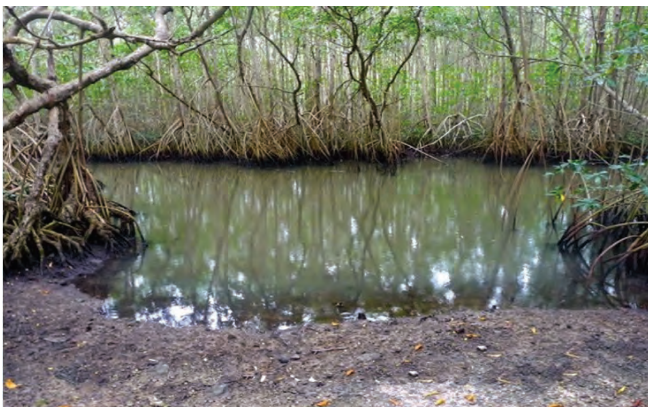
Figure 5. Pond with Periophthalmus , Senegal.