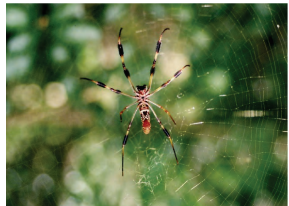
Figure 8. Nephila claviceps , in the dry tropical forest of the Caribbean. The thread of the web is stronger than steel and is excellent for neuronal regeneration in mammals; it is antibacterial and does not trigger immune rejection.