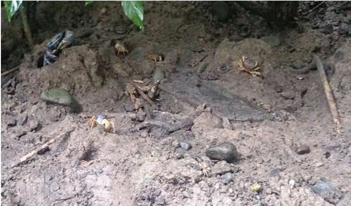
Figure 3. Mangrove crabs.