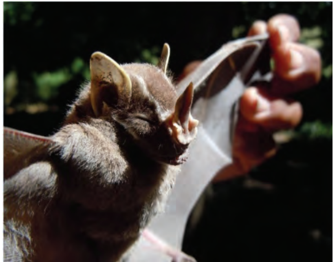
Figures 15, 16. Disoriented Glossophaga bat saved in the yard by Kevin.