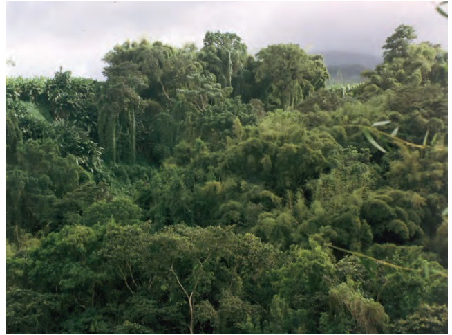
Figure 23. Tropical rainforest in the Great African Rift (Virunga).