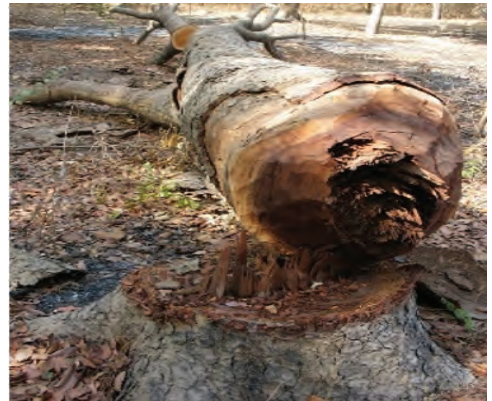
Figure 10. Ebony tree chopped down to make room for pastures, Senegal.