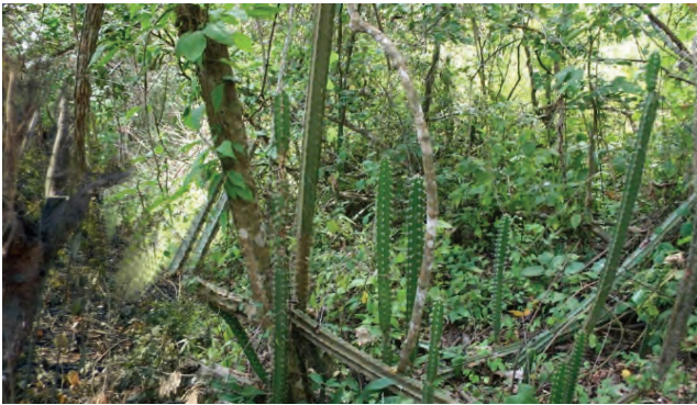
Figure 13. Cacti in a dry tropical forest, Costa Rica, Nicaragua.