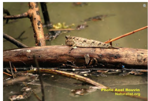
Figure 6. Periophthalmus barbarus , Senegal.