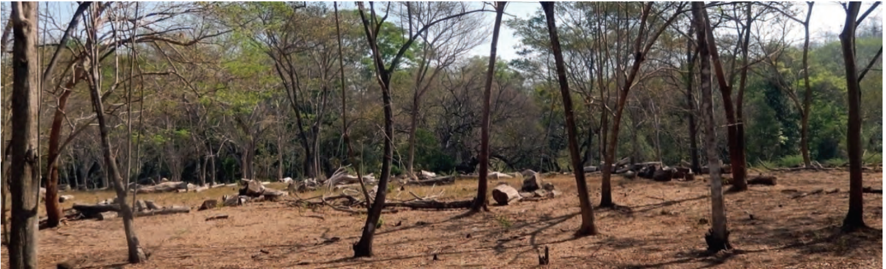
Figure 19. Part of a native-tree-deforestation zone.