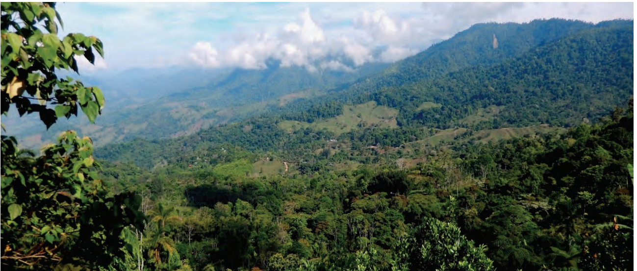
Figure 11. Forest fragmentation, Costa Rica.