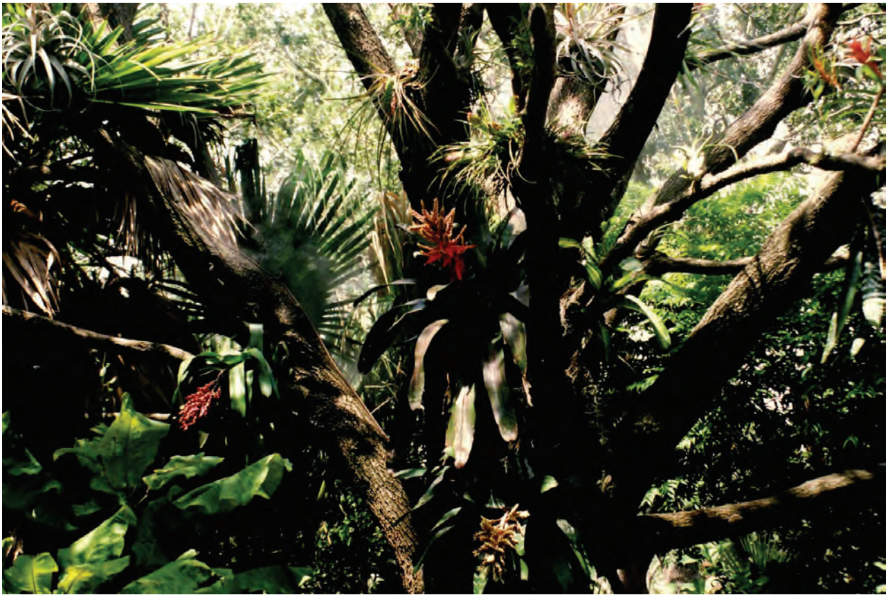
Figure 28. Bromeliaceae in the tropical rainforest of Dominica.