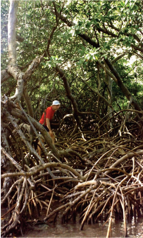
Figures 1, 2. Mangrove thickets.