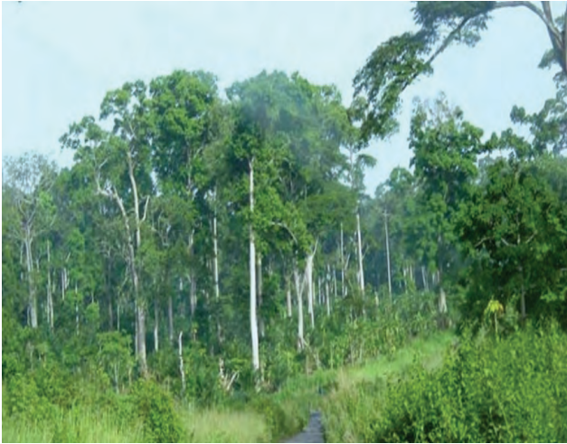
Figure 22. Outpost of the tropical rainforest in Bangui (Central African Republic).