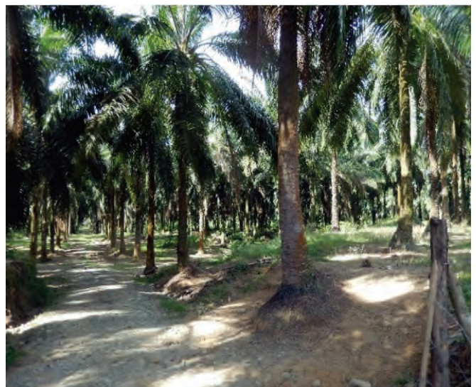
Figures 17, 18. Cutting down of secular native trees to replace them with Elaeis guineensis plantations, Costa Rica.