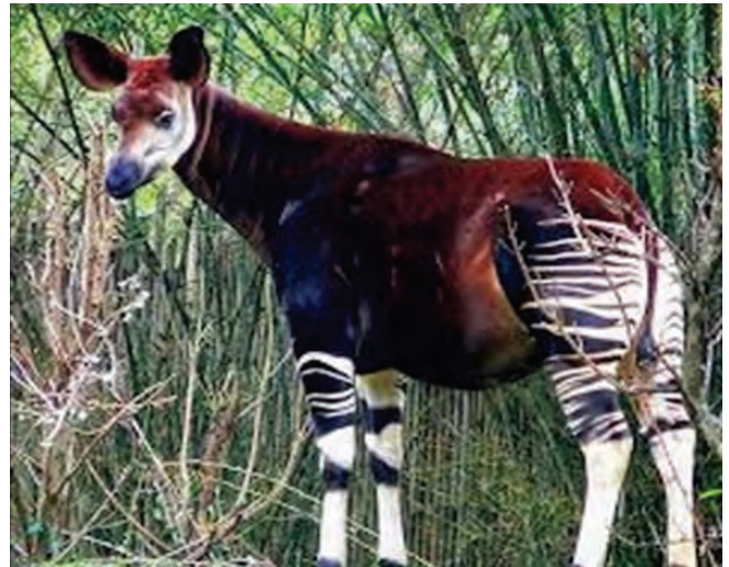
Figures 24, 25. Ituri forest and one of the residents of Epulu Station and Okapi.