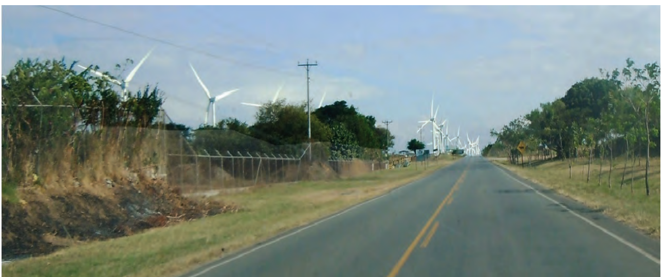
Figure 21. Wind farms, Guanacaste CR and Nicaragua.