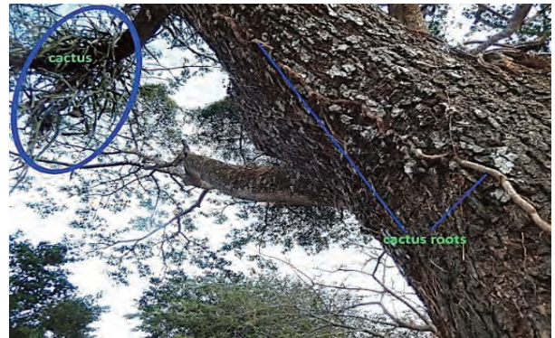
Figure 14. At the limit of the forest, semi-epiphytic cacti start growing on trees ( Hylocereus –pitahaya cactus, which bears the comestible dragonfruit).