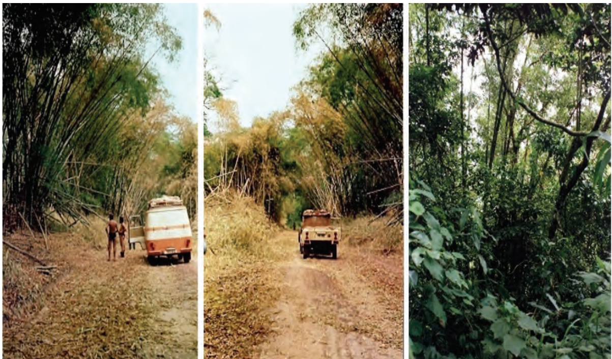
Figure 29. Bamboo forests at the edge of the tropical rainforest in Africa and Central America.